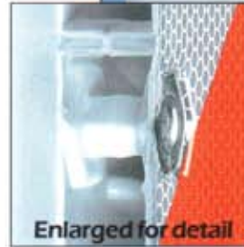
Enlarged for detail