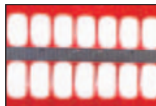
NITE LITE II

Plastic Safety Systems, Inc. 2444 Baldwin Road Cleveland, Ohio 44104 Fax: 216.231.2702