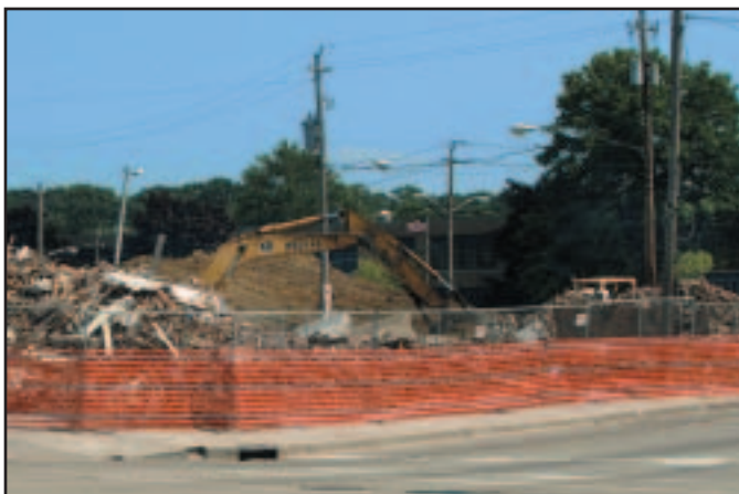
Photos shown above illustrate Nite Lite II protecting pedestrians and areas heavy with traffic.