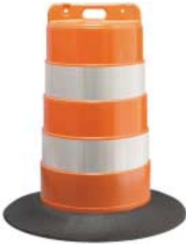
LIFEGARD™ "The Original Sandless Drum" U.S. Patent No. 5,234,280 & Canadian Patent No. 2,083,918

Plastic Safety Systems, Inc. ♦ 2444 Baldwin Road ♦ Cleveland, OH 44104 800-662-6338 ♦ 216-231-2702 fax ♦ www.plasticsafety.com ♦ On the Roadway for Safety®